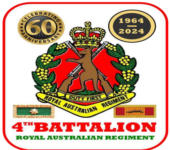
$5.50 Postage Included Limited Number

Thank you for your support it is very much appreciated.