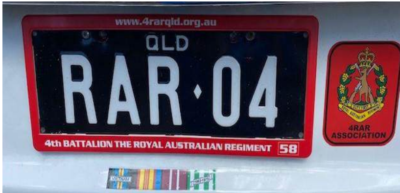
$35 Plus Postage