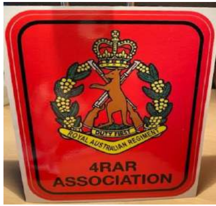
$5.50 Including Postage