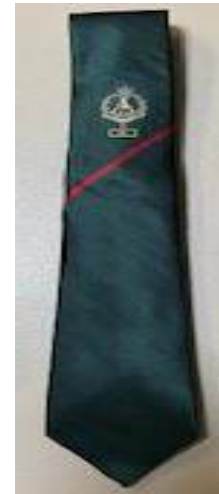
$35 Plus Postage