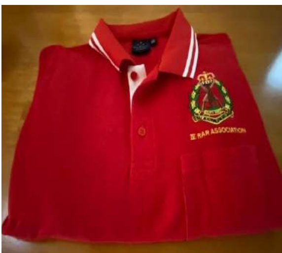
$50 Plus Postage