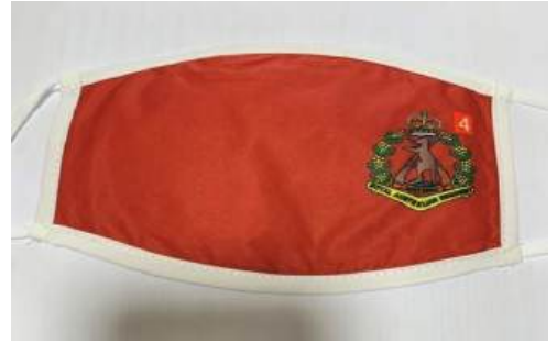
$15 Including Postage