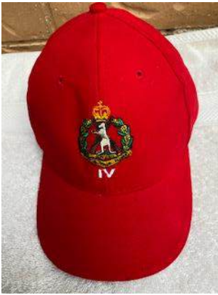
Cap $30 Plus Postage